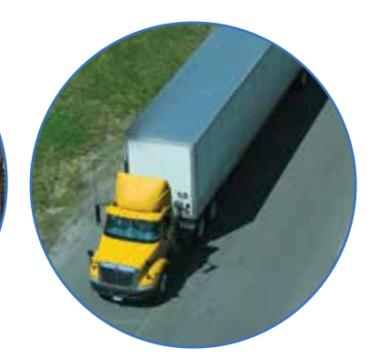
Drivers Certification Program for Class 1, 2, and 3