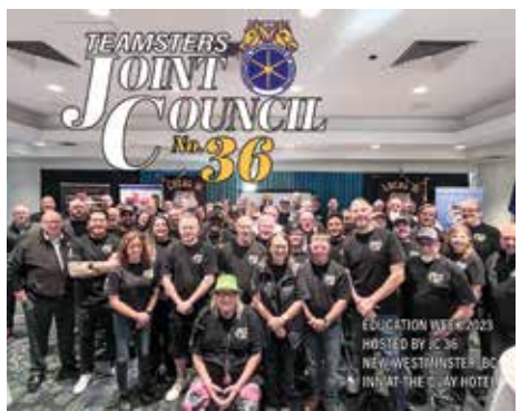
Teamsters members at the Joint Council 36 Advanced Shop Steward Training Seminar and Education Week.

With the success of our shop steward training seminars over the years, Joint Council 36 held their inaugural Advanced Shop Steward Training Seminar in 2023 at the Inn at the Quay in New Westminster. The five-day event was highly successful and will be held again in 2024.