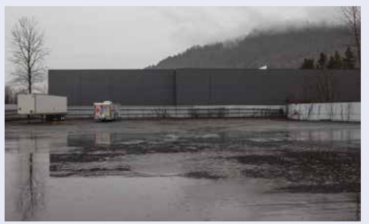
The back of the property includes almost three acres (1.2 hectares) for commercial drivers' license training and training for off-road vehicles, such as rock trucks and front-end loaders.