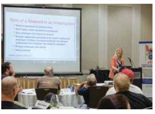
Teamsters 213 Shop Steward Seminar in Vancouver.

Both of the local's shop steward seminars were huge successes with the Vancouver seminar hosting over 100 stewards from all industries. The dates for 2024 are Saturday, May 11th for Kelowna and Saturday, November 16th for Vancouver.