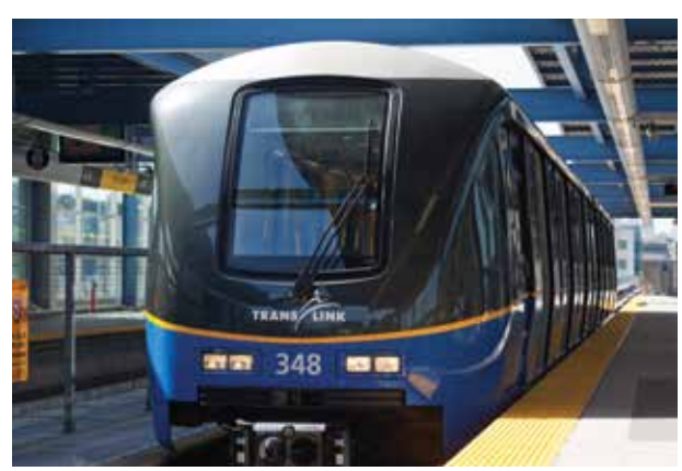
The Surrey Langley SkyTrain project will extend the Expo Line 16 kilometers primarily along Fraser Highway on an elevated guideway from King George SkyTrain Station in Surrey to 203 Street in Langley City. It includes eight stations and three transit exchanges.