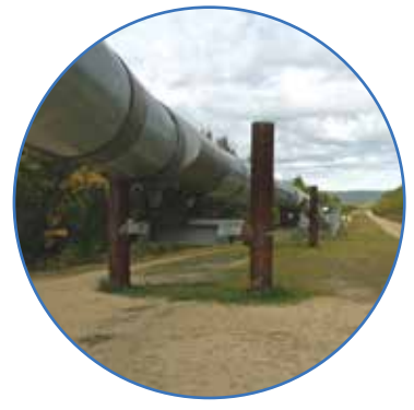
Pipeline Safety Training Requirements