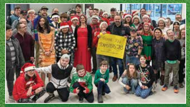
Special Olympics BC is very appreciative of this generous donation and would like to thank all the sponsors, participants and volunteers.

We are happy to announce that the Teamsters Local 213 Annual Charity Golf Tournament was a great success. With the help of the golfers and all our generous donors, we were able to raise $39,010 for the BC Special Olympics. Please save the date for our next tournament which will be held in Penticton again on September 14th, 2024.