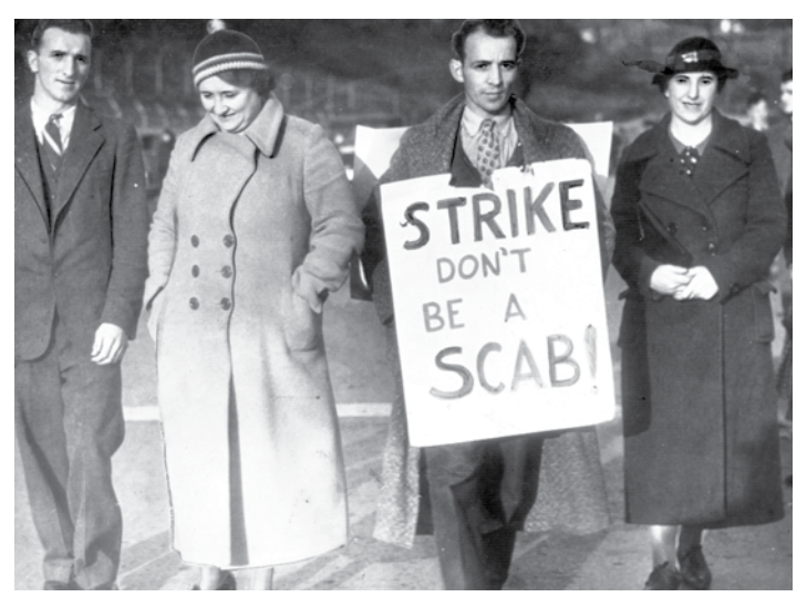
Union members today face similar issues as the workers pictured here did in 1936.

In addition, except in cases of essential services, or when the strike or lockout does not affect all employees, an employer cannot use the services of any employee within the bargaining unit.