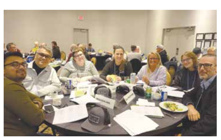
Lower Mainland Shop Stewards taking a moment away from workshops and skill training.