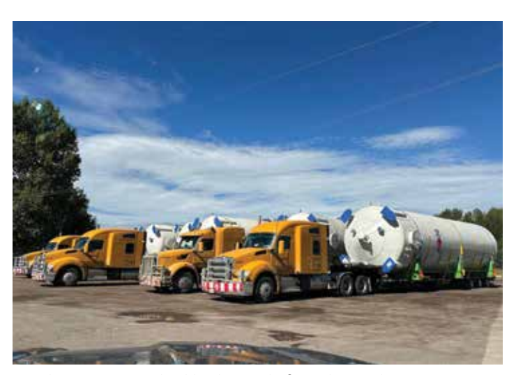
Members at Arrow Reload hauling tanks from the Northwest.