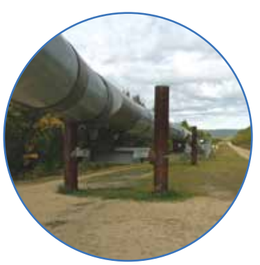
Pipeline Safety Training Requirements