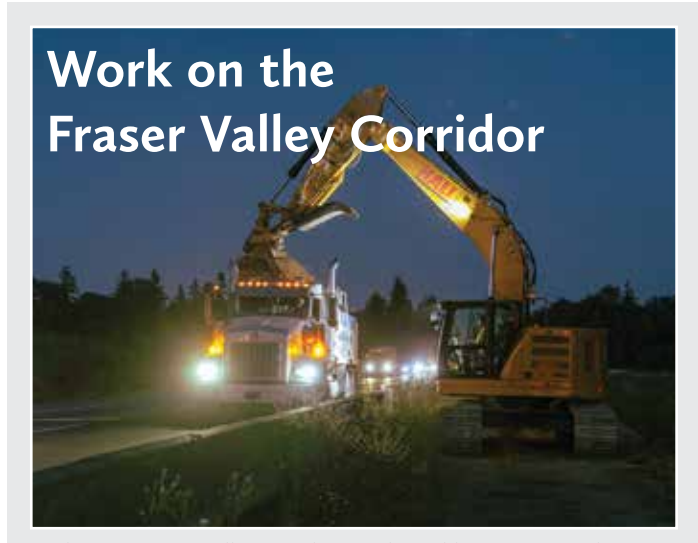
Highway 1 Fraser Valley corridor westbound lane near 232nd Street Interchange. Soil being loaded from the median into a dump truck in the left westbound lane.

With these major initiatives moving full speed ahead, the Lower Mainland is primed for an exciting and prosperous few years. The momentum is building, and the future is bright. Let's continue working together to make 2025 and beyond a time of great growth and success for everyone involved.