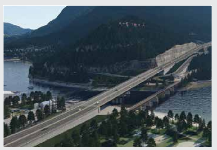
The replacement of the RW Bruhn Bridge with a four-lane structure will also see improvements of 2.5 kilometers of Highway 1, including four-laning of 1.9 kilometers of highway, and upgrading intersections between Old Sicamous and Silver Sands roads.