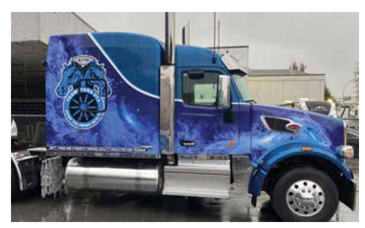
The new Training School offers instruction with a Peterbilt, featuring the Training School wrap.

Our new Training School in Chilliwack is gearing up for our grand opening in the spring. Renovations are in full force, with the MELT (Mandatory Entry Level Training) program going through final details. Soon our members will be able to get assistance on getting their Class 1 or Class 3 driving licenses and take advantage of the many courses that the school will offer.