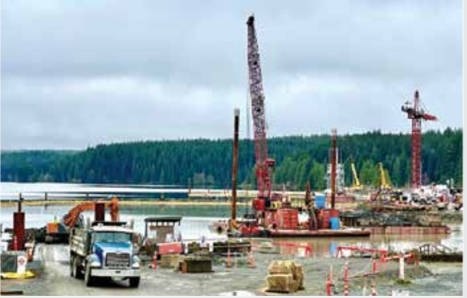
Dredgeate removal within the reservoir and the unloading of the material into dump trucks to be placed within the old penstock corridor.