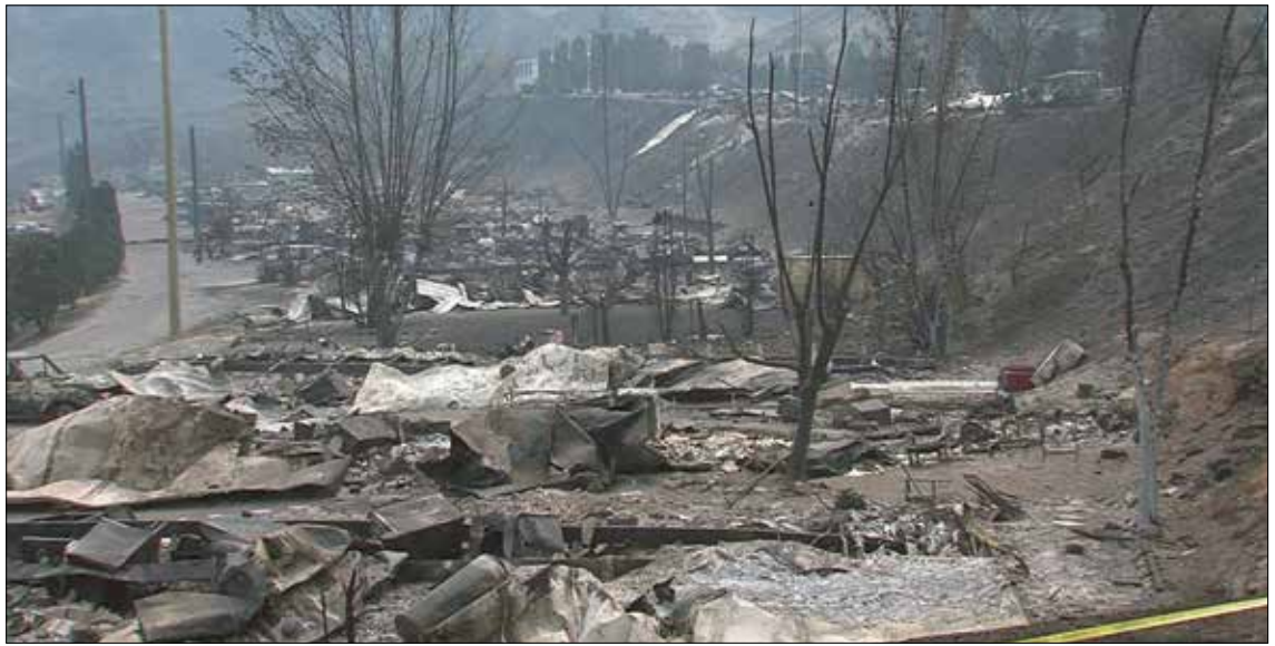
The trailer park at Boston Flats after the wildfire swept through on July 7.

"The hundreds of fires in the Interior began in April. The state of emergency was finally lifted in September. By that time, the fires had covered 11,700 square kilometres, and $750 million was spent to fight them. Over 65,000 people were evacuated. Fires also raged this summer in Washington, Oregon, and California, Alberta and Saskatchewan."