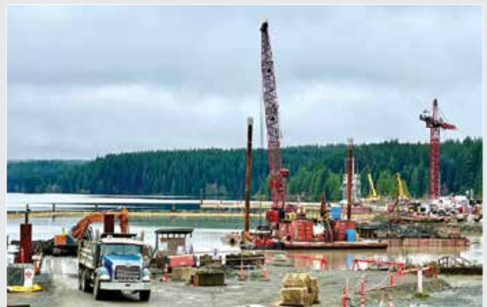
Dredgates removal within the reservoir and the unloading of the material into dump trucks to be placed within the old penstock corridor.