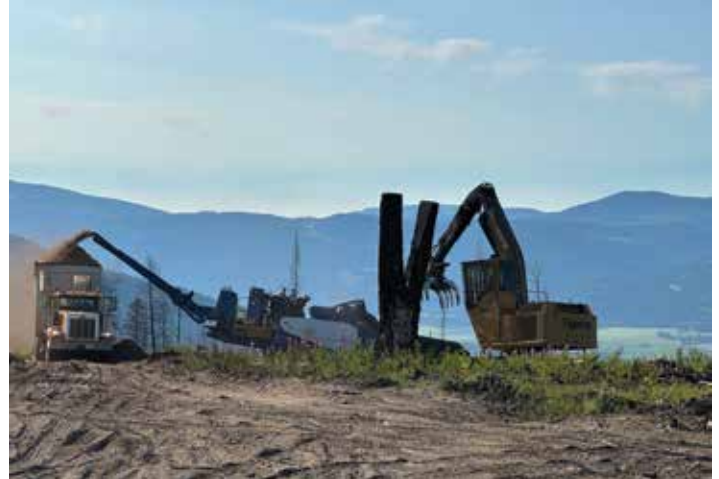
Members at Arrow PWP Wood Grinding and PWP South Trucking grind wildfire wood near Monty Lake. The fire-affected wood is then hauled to the mill in Kamloops.

On the federal side, our members working for Paladin Airport Security Services doing pre-board airport security are also eager to get to the table in the new year to work on a renewal