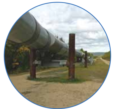
Pipeline Safety Training Requirements