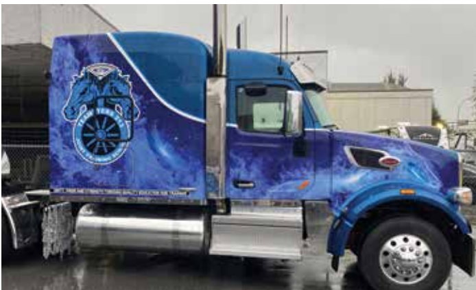
The new Training School offers instruction with a Peterbilt, featuring the Training School wrap.

Our new Training School in Chilliwack is gearing up for our grand opening in the spring. Renovations are in full force, with the MELT (Mandatory Entry Level Training) program going through final details. Soon our members will be able to get assistance on getting their Class 1 or Class 3 driving licenses and take advantage of the many courses that the school will offer.