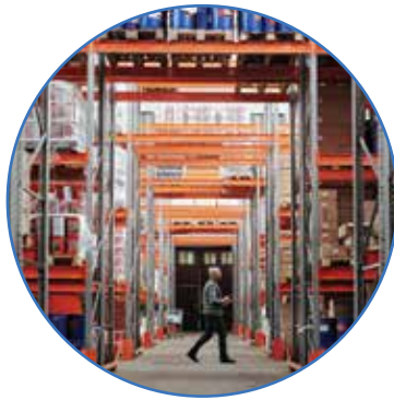
Pipeline & Heavy Construction Warehouse