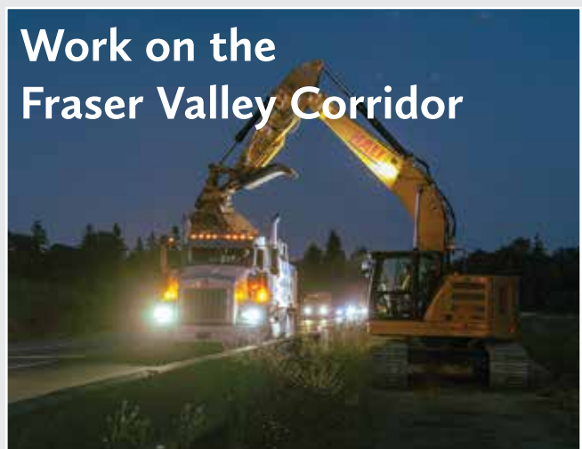
Highway 1 Fraser Valley corridor westbound lane near 232nd Street Interchange. Soil being loaded from the median into a dump truck in the left westbound lane.

With these major initiatives moving full speed ahead, the Lower Mainland is primed for an exciting and prosperous few years. The momentum is building, and the future is bright. Let's continue working together to make 2025 and beyond a time of great growth and success for everyone involved. 🌍