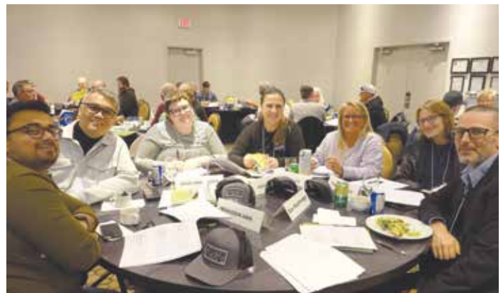
Lower Mainland Shop Stewards taking a moment away from workshops and skill training.