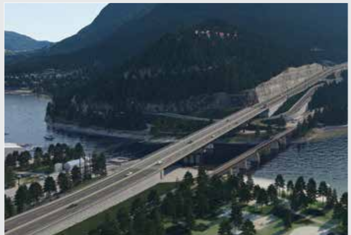
The replacement of the RW Bruhn Bridge with a four-lane structure will also see improvements of 2.5 kilometers of Highway 1, including four-laning of 1.9 kilometers of highway, and upgrading intersections between Old Sicamous and Silver Sands roads.