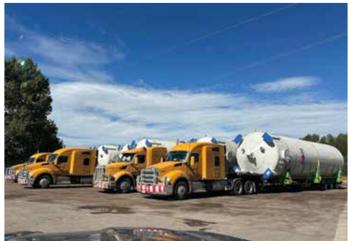
Members at Arrow Reload hauling tanks from the Northwest.