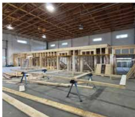
Early renovations saw the construction of the first-floor classroom and storage area in the Instructor Pod.

Looking forward to great year! Stay safe and always keep learning! 🌐