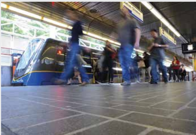
The Surrey Langley SkyTrain project will extend the Expo Line 16 kilometers, primarily along the Fraser Highway on an elevated guideway from King George Station in Surrey to 203 Street in Langley City. It includes eight stations and three transit exchanges. The budget for the Surrey Langley SkyTrain is $5.996 billion.