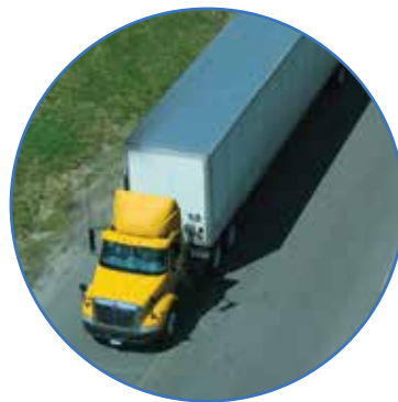
Drivers Certification Program for Class 1, 2, and 3